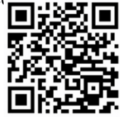
Digital Visitor Card

In the pew you will find an information card. Please leave us information on how we might be in touch with you to share more about life at Westover Hills. We would love to share a little about our story and hear more about yours. If you do not see a card in the pew near you, please ask one of the ushers you saw when you came in and we will be sure to get one for you. If you prefer, please scan the QR code below to be directed to the contact page of our website.