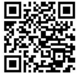
Digital Visitor Card

We are so glad to be worshiping with you today. If this is your first visit, welcome! If you have been with us before, welcome back! Whether you are a life-long Presbyterian, a brand-new Christian, or someone who is just trying to make sense of this world we share, we hope you will feel at home at Westover Hills Presbyterian.