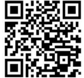
Digital Visitor Card

In the pew you will find an information card. Please leave us information on how we might be in touch with you to share more about life at Westover Hills. We would love to share a little about our story and hear more about yours. If you do not see a card in the pew near you, please ask one of the ushers you saw when you came in and we will be sure to get one for you. If you prefer, please scan the QR code below to be directed to the contact page of our website.