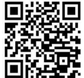
Digital Visitor Card

In the pew you will find an information card. Please leave us information on how we might be in touch with you to share more about life at Westover Hills. We would love to share a little about our story and hear more about yours. If you do not see a card in the pew near you, please ask one of the ushers you saw when you came in and we will be sure to get one for you. If you prefer, please scan the QR code below to be directed to the contact page of our website.