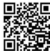
Digital Visitor Card

In the pew you will find an information card. Please leave us information on how we might be in touch with you to share more about life at Westover Hills. We would love to share a little about our story and hear more about yours. If you do not see a card in the pew near you, please ask one of the ushers you saw when you came in and we will be sure to get one for you. If you prefer, please scan the QR code below to be directed to the contact page of our website.